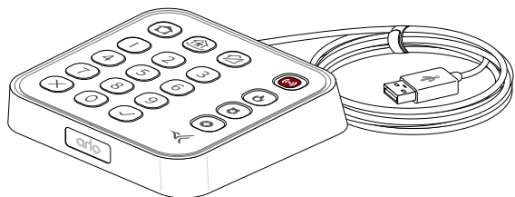
Keypad Sensor Hub with integrated cable